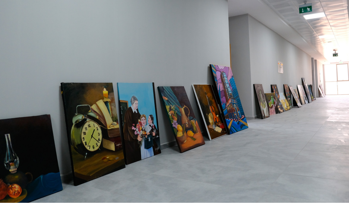
Works of Art by the pupils of the Van Edremit High- school in Türkiye © Abdullah ETE